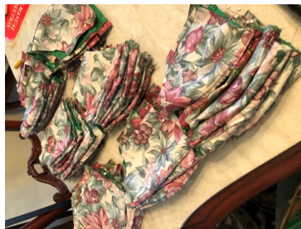
Completed masks ready to be shipped for use.