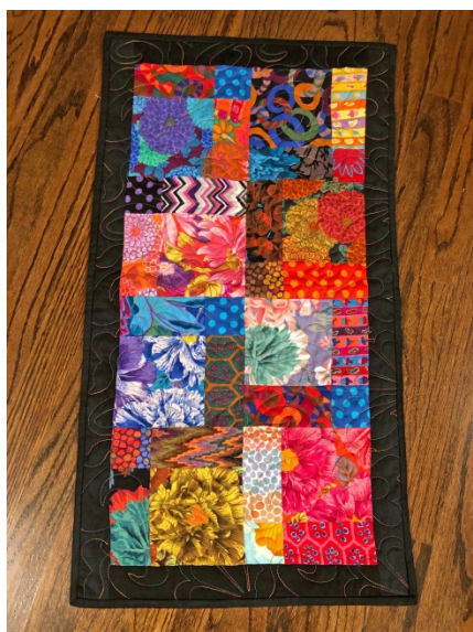
Table runner from left over quilt blocks, all made from stash on hand.