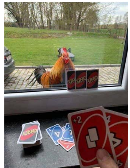
Quarantine, day 11

The International Day of Families recognizes the family as the basic unit of society and provides an opportunity to promote awareness of issues relating to families.