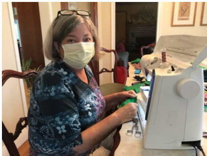
Pat hard at work!!

They practice social distancing and wear their masks as instructed by our Governor.