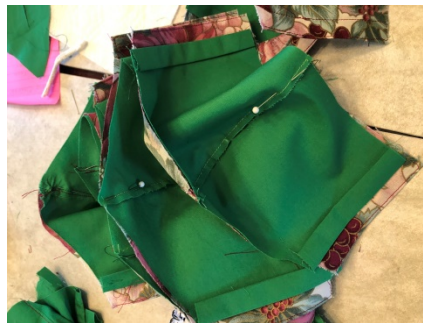
Masks have to be cut and pinned.