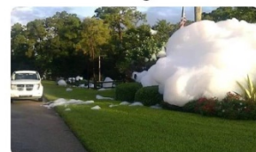
I disinfected the entire house in 10 minutes