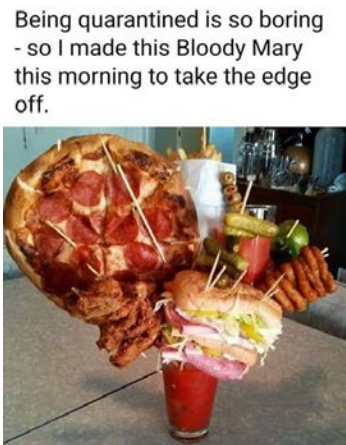
Being quarantined is so boring - so I made this Bloody Mary this morning to take the edge off.