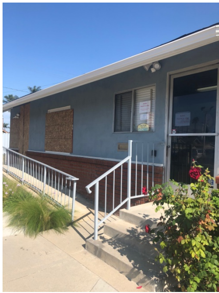
Boydston Reality Boarded up Curfews Come to Anaheim

Protests of over 500 people demonstrated in Anaheim. The demonstrations were reasonable peaceful but the streets around City Hall and Anaheim Boulevard were closed down. At the recommendation from city officials, Boydston Reality and Hilgenfeld Mortuary were closed down and board up to protect against riots and looters. Ganahl Lumber donated wood to some owners to use for boarding and protecting their businesses. The demonstrations remained peaceful and the curfews were appreciated.