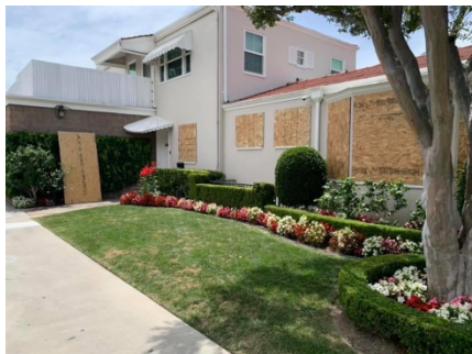
Hilgenfeld Mortuary all boarded up

Protests of over 500 people demonstrated in Anaheim. The demonstrations were reasonable peaceful but the streets around City Hall and Anaheim Boulevard were closed down. At the recommendation from city officials, Boydston Reality and Hilgenfeld Mortuary were closed down and board up to protect against riots and looters. Ganahl Lumber donated wood to some owners to use for boarding and protecting their businesses. The demonstrations remained peaceful and the curfews were appreciated.