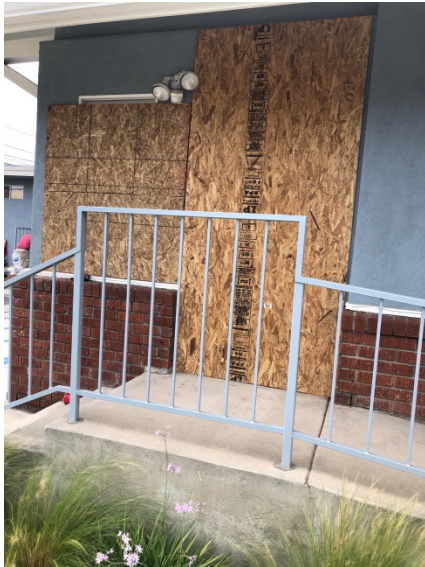
Boydston Reality protected doors and windows