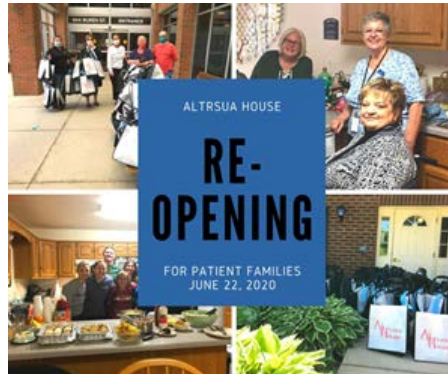
Green Bay, WI Club - Re-Opening Altrusa House and donated goodies to healthcare workers on the frontline.