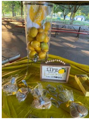
Red Oak, IA Club - Theme for 2020-2021 "When life gives you lemons... make lemonade!" Life has given us many "lemons" so far in 2020! Let's take those lemons & change the world!