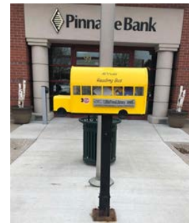
Fremont, NE Club - One of two Little Free Libraries.