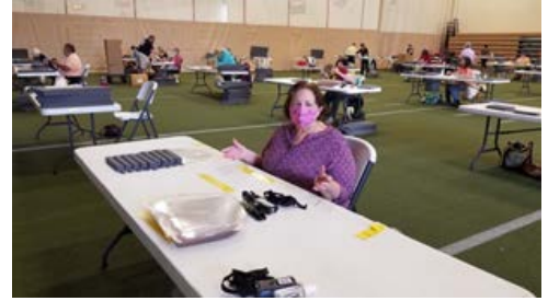
Duluth, MN Club - Club members/friends made PPE/face shields; over 4,000 during the 4 hours.