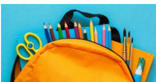
Bellevue, NE Club - School supplies for service project.