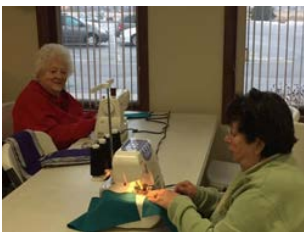
Marshfield, WI Club - Surging Forward with Literacy for Days for Girls.