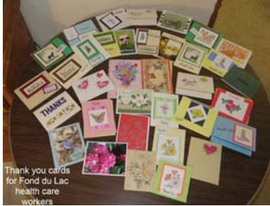
Fond du Lac, WI Club - Made Thank you cards for Fond du Lac Health Care Workers and Police Officers.